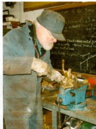
Chief Engineer at work

The proposal is to replace the cast iron bars with fabricated mild steel, which in future can be straightened and weld repaired as required. The material to make new is now on order.